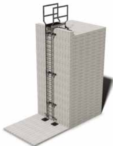
Ladder with step through & step down - no hoops