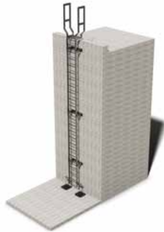
Ladder with step through - no hoops

Please see data sheet overleaf for the many options available.