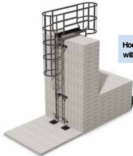
Hooped Ladder with platform